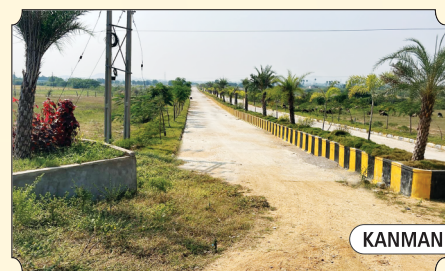
KANMANI @ Bhootpur