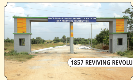
1857 REVIVING REVOLUTION @ Bhongir, Yadadri