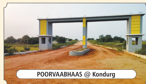
POORVAABHAAS @ Kondurg